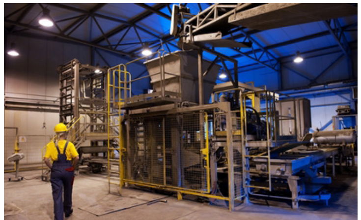
Factory worker

Chlorinated dioxins and furans are highly hazardous compounds that can have a range of adverse health impacts, even at very low levels of exposure. The most potent dioxin compound (TCDD) is a known human carcinogen, reproductive and developmental toxicant, and alters function of the immune and endocrine systems. Low level exposures are particularly hazardous for the developing fetus and infant. Dioxins and related organochlorines are also persistent and bioaccumulative. As a result, they contaminate the food chain through which all humans are exposed. These widely acknowledged hazards and exposure pathways led to the inclusion of dioxins and furans in the Stockholm Convention .